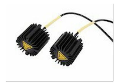
35020-10, Porsche 997 all except convertible