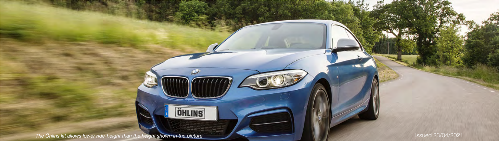
The Öhlins kit allows lower ride-height than the height shown in the picture