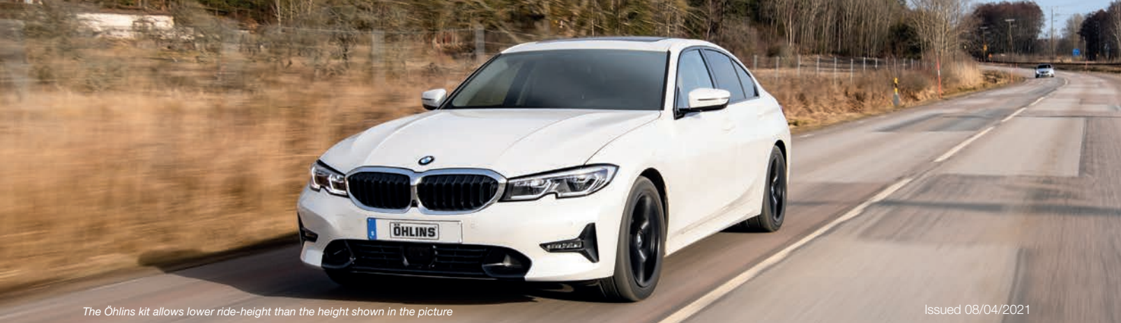
The Öhlins kit allows lower ride-height than the height shown in the picture