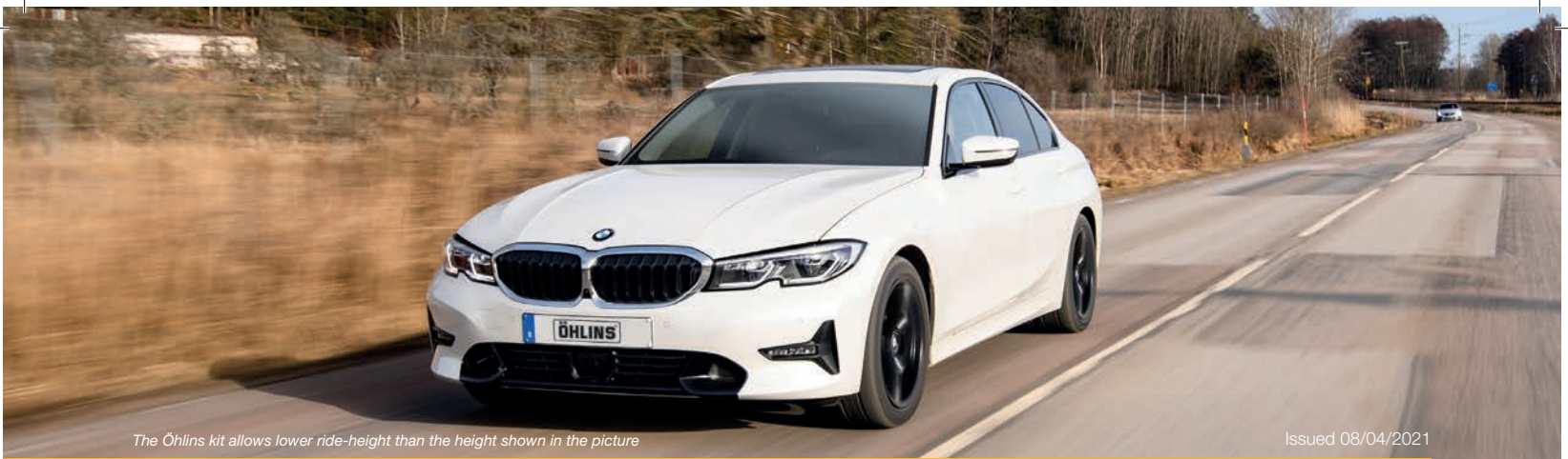
The Öhlins kit allows lower ride-height than the height shown in the picture