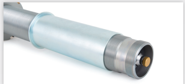
Please note the picture above is of a prototype product which may slightly differ in appearance from the finalized product